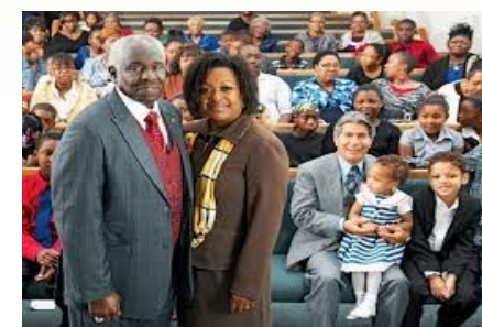
Passionately Serving Children and Building Loving Families Through Adoption Ministry

In a word, PRAYERFULLY! Building a family is a process that requires the peace and love of God in your life. Thankfully, we had that and still do to this day. It was with God's peace and His love that we received this calling to adoption ministry. It was with God's peace and His love that we sought after the most unwanted children. It again was with God's peace and His love that we opened our homes, entreated our biological children, our church and community to become a sanctuary where love could reign, with patience and understanding, to meet the needs of neglected and abused children. And, it is with God's peace, His love and great joy that we share this with you today. We want to help your church begin to build families through the ministry of adoption. Start now! Will you contact us today?